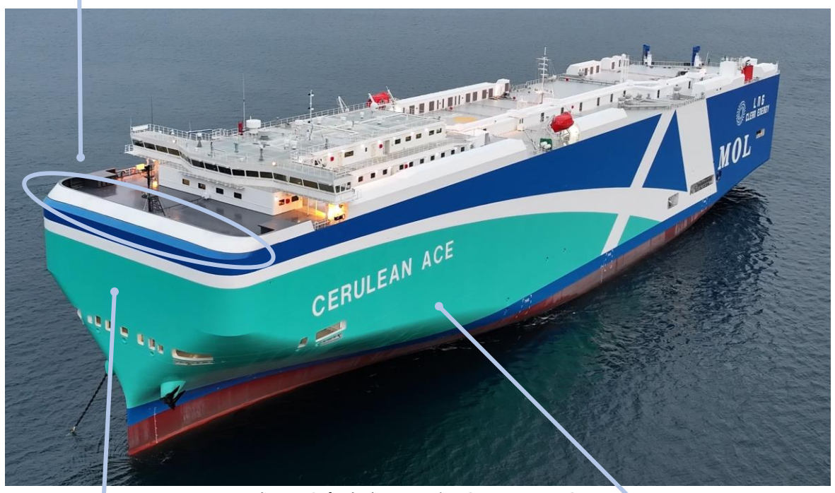
The LNG-fueled car carrier CERULEAN ACE

Introduced an aerodynamics design (Beveled top of bow) that reduces wind resistance by 20%