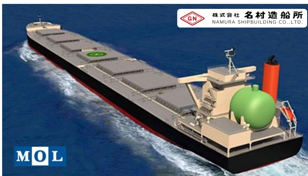
CG of a coal carrier scheduled for actual ship demonstration

A portion of the methane in LNG fuel is exhausted into the atmosphere as unburned methane. Methane has a higher greenhouse effect than CO 2 , and methane slip reduction is required from the perspective of greenhouse gas reduction.