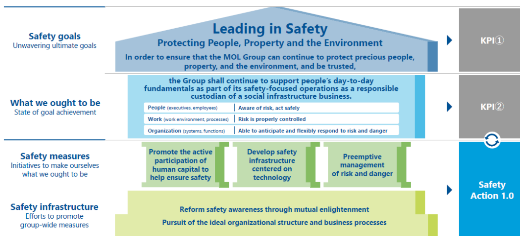
(Big picture of Safety Vision)

In January 2024, it established the Safety Vision, which outlines the MOL Group's approach and framework for safety, positioned to support “Safety & Value.” The Safety Vision consists of a roof section consisting of “Safety goals” and “What we ought to be” and a pillar/foundation section consisting of “Safety measures” and “Safety infrastructure” (collectively, Safety Action 1.0 = Action Plan). The approach is to achieve the “safety goals” and realize “What we ought to be” by implementing the action plan.