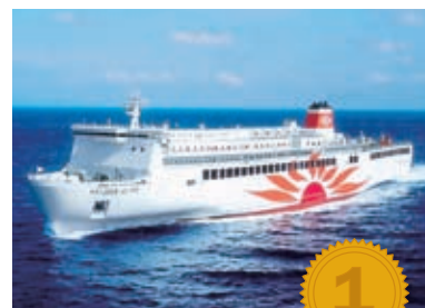
The ferry Sunflower Gold

Ferry Sunflower Gold: Operated by The Diamond Ferry Co., Ltd., an MOL Group company, the Sunflower Gold picked up the Outstanding Ferry Technology Award at the ShipPax Award 2008, which is sponsored by ShipPax Information of Sweden. The award recognized efforts to reduce greenhouse gas emissions through the bold adoption of a single screw hullform. This award was created in 1999 and is bestowed on vessels boasting outstanding technologies and designs from newly delivered ferries, RORO and cruise vessels worldwide.