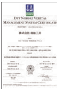
Certificate of ISO 14001, an international standard for environmental management (Certified by DET NORSE VERITAS (DNV))

*Merged with MOL Ferry Co., Ltd. in June 2007