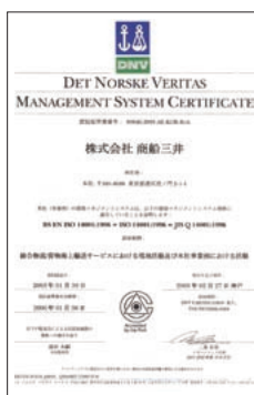
Certificate of ISO 14001, an international standard for environmental management (Certified by DET NORSKE VERITAS (DNV))

* Merged with MOL Ferry Co., Ltd. in June 2007