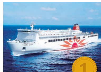
The ferry Sunflower Gold

Ferry Sunflower Gold: Operated by The Diamond Ferry Co., Ltd., an MOL Group company, the Sunflower Gold picked up the Outstanding Ferry Technology Award at the ShipPax Award 2008, which is sponsored by ShipPax Information of Sweden. The award recognized efforts to reduce greenhouse gas emissions through the bold adoption of a single screw hullform. This award was created in 1999 and is bestowed on vessels boasting outstanding technologies and designs from newly delivered ferries, RORO and cruise vessels worldwide.